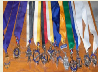
Knights of Columbus Officer's Jewels

so powerful is the light of unity that it can illuminate the whole world. As your District Deputy, I offer you this advice.