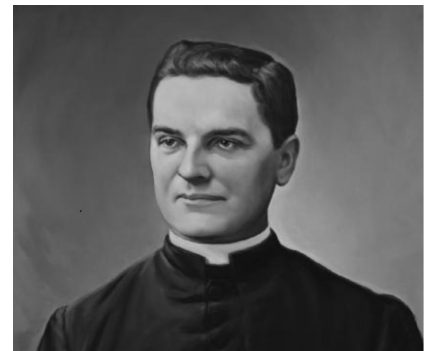
Blessed Father McGivney

The Father McGivney Guild 1 Columbus Plaza New Haven, CT 06510 USA www.fathermcgivney.org